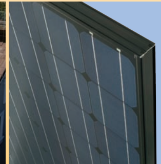
Laminated glass construction in a high torsion frame.