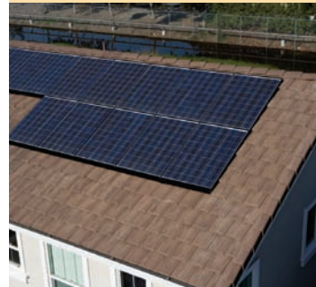
Black frame improves aesthetics for residential roof top applications.

This module uses an advanced solar cell surface texturing process to increase light absorption and improve efficiency.