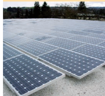
The NU-U235F2 offers industry-leading performance for a variety of applications.

156 mm monocrystalline solar cells provide high power output. Ideal for large commercial rooftops where space is a premium.