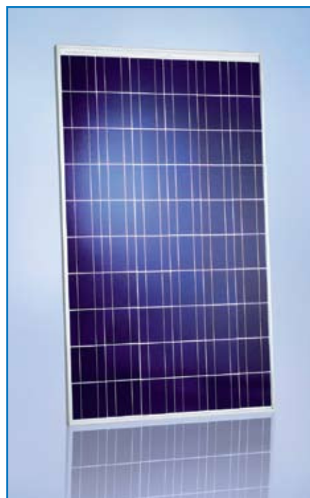
SCHOTT POLY™ 225/220/217/210